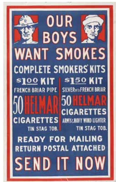
Figure 2: Wartime Tobacco Advertisement